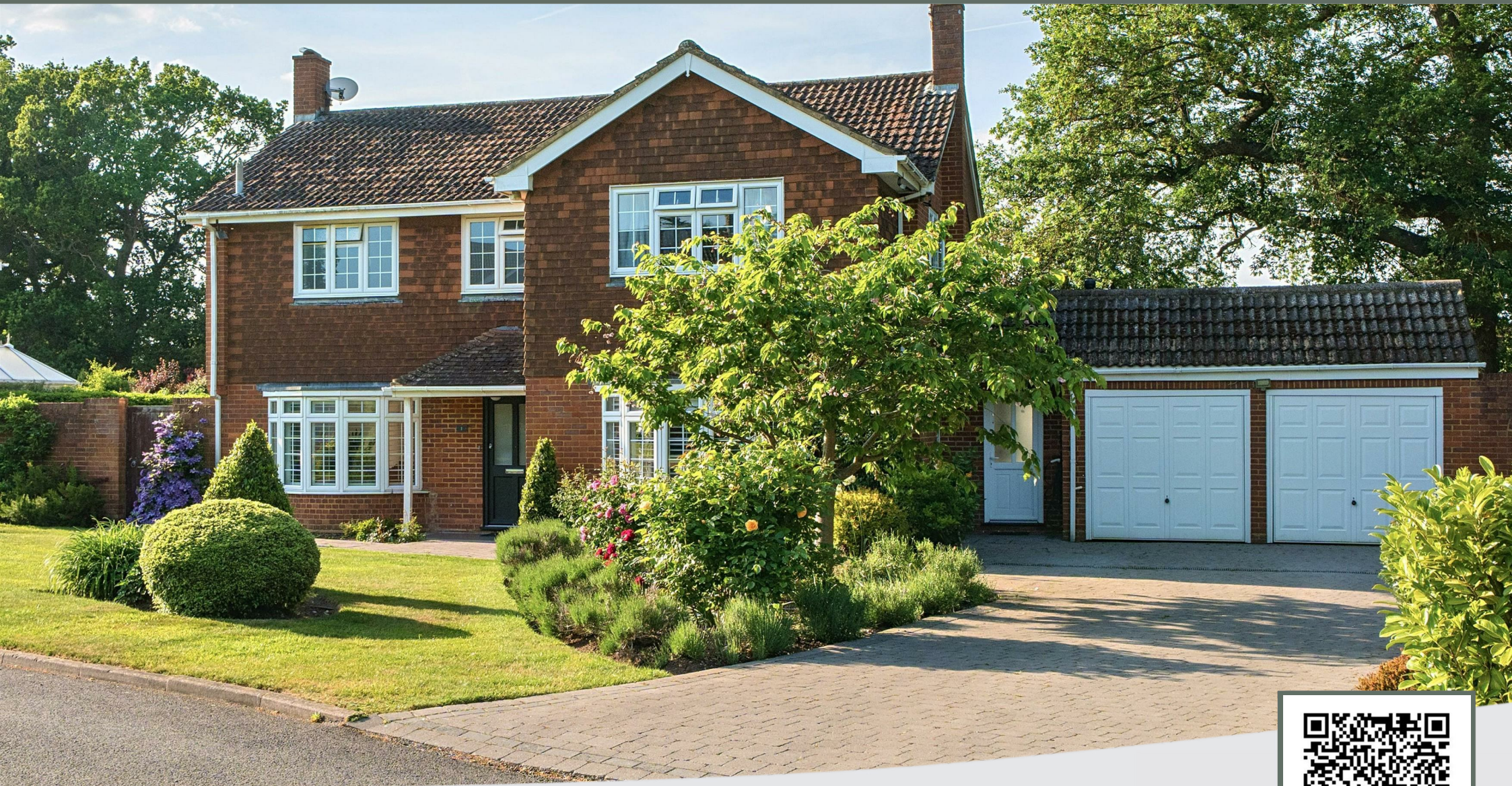
1 The Ridings East Horsley, Surrey KT24 5BN